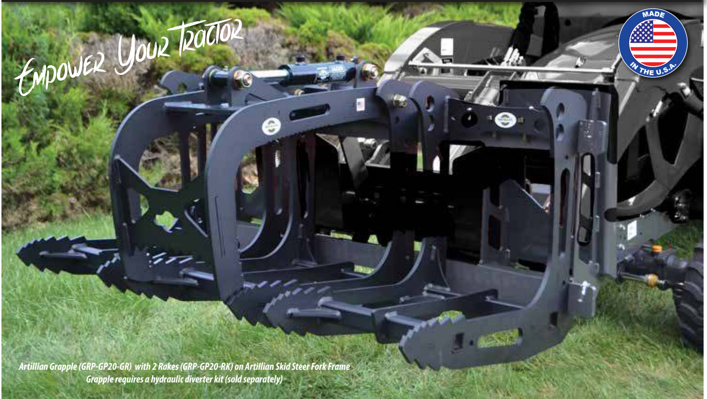
Artillian Grapple (GRP-GP20-GR) with 2 Rakes (GRP-GP20-RK) on Artillian Skid Steer Fork Frame Grapple requires a hydraulic diverter kit (sold separately)

Artillian's modular design lets you mix-&-match sections to fit your needs.