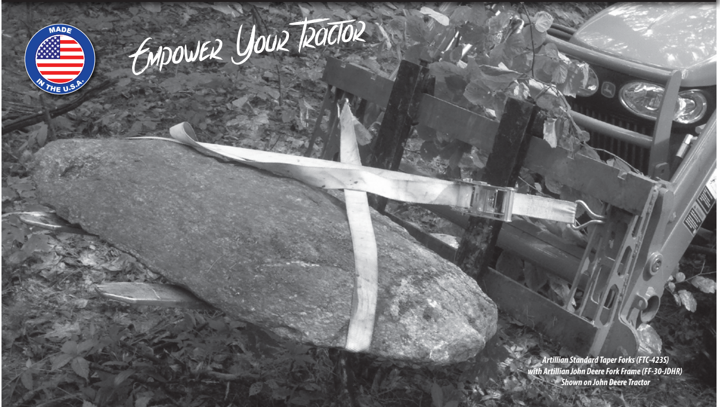
Artillian Standard Taper Forks (FTC-423S) with Artillian John Deere Fork Frame (FF-30-JDHR) Shown on John Deere Tractor

Compatible with John Deere and Skid Steer Quick Attach Loaders (Kubota, Mahindra, Massey Ferguson & Yanmar)