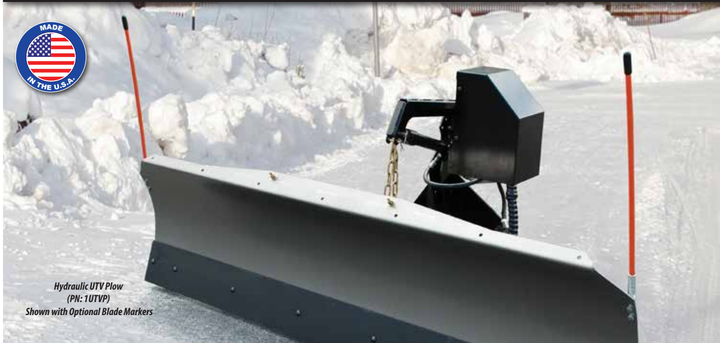
Hydraulic UTV Plow (PN: 1UTVP) Shown with Optional Blade Markers

Custom Mounts for: John Deere Gator XUV 615, 625, 815, 835, 865: 2011 & newer | 825 & 855 S2&4: 2011 & newer Polaris Ranger XP900: 2013 ~ | Club Car XRT1551 Kawasaki Mule Pro FX/DX, Pro FXT/DXT