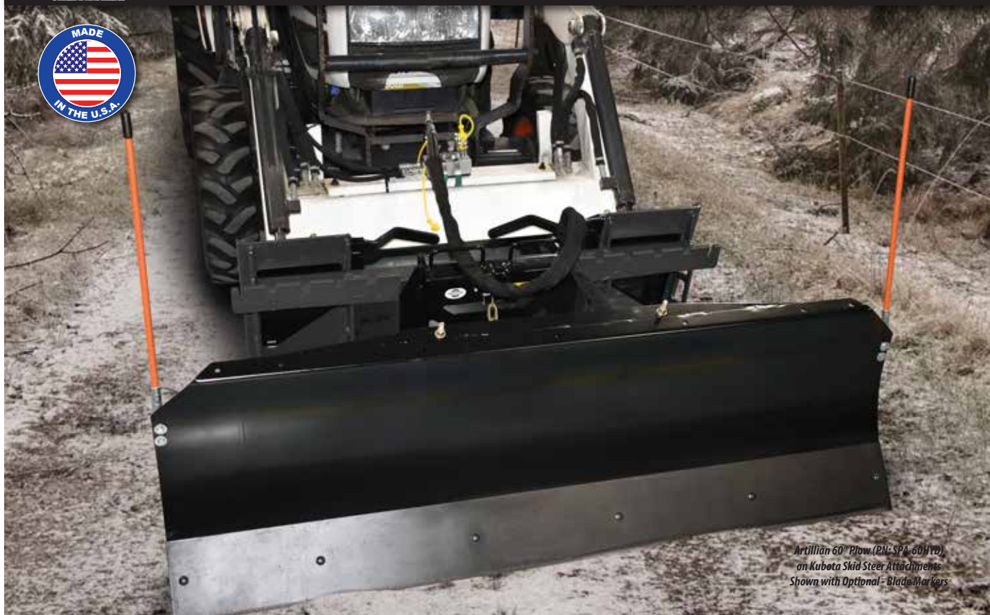
Artillian 60" Plow (PN: SPA-60HY) on Kubota Skid Steer Attachments Shown with Optional - Blade Markers

Fits (2015 ~) Artillian Pallet Fork Frame