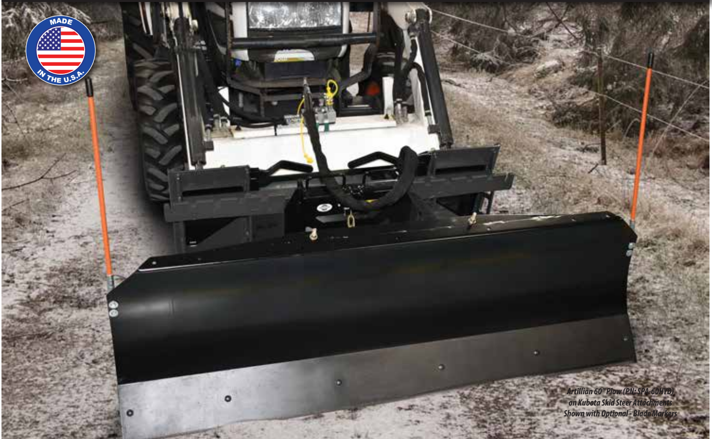
Artillian 60" Plow (PN: SPA-60HY2) on Kubota Skid Steer Attachments Shown with Optional - Blade Markers

Fits (2015 ~) Artillian Pallet Fork Frame